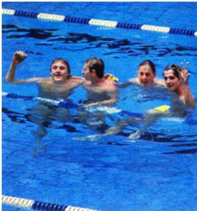
Alexandre Sidorenko (URS), le vainqueur du 400 m 4 nages