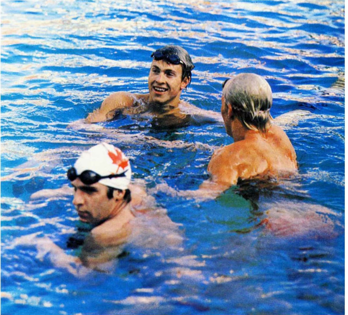
Vladimir Salnikov (URS, au centre) emporta les médailles d'or en 400 m et 1500 m libre