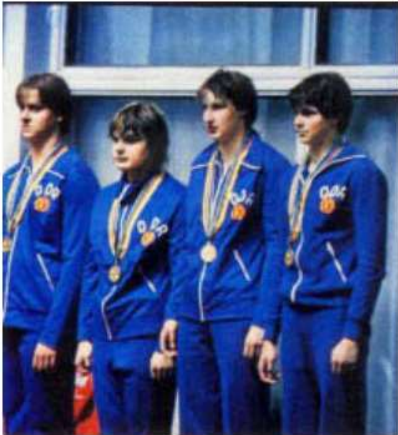
Les gagnantes en 400 m 4 nages. De gauche à droite: Sharron Davies (GBR, 2 e place), Petra Schneider (GDR, 1 er place), Agnieszka Czopek (POL, 3 e place)