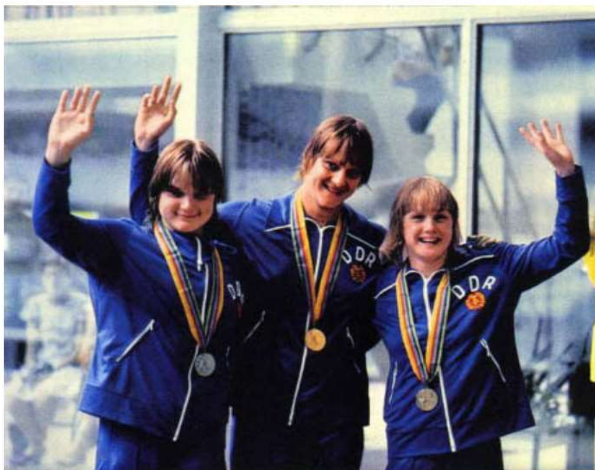
Ines Geissler (GDR), la championne du 200 m papillon Ines Geissler, GDR, winner in the 200 m butterfly