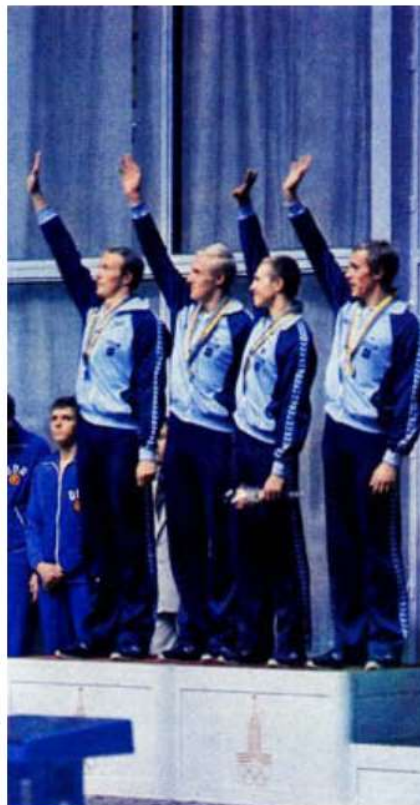
Les nageurs de l'URSS, les vainqueurs du 4X200 m libre