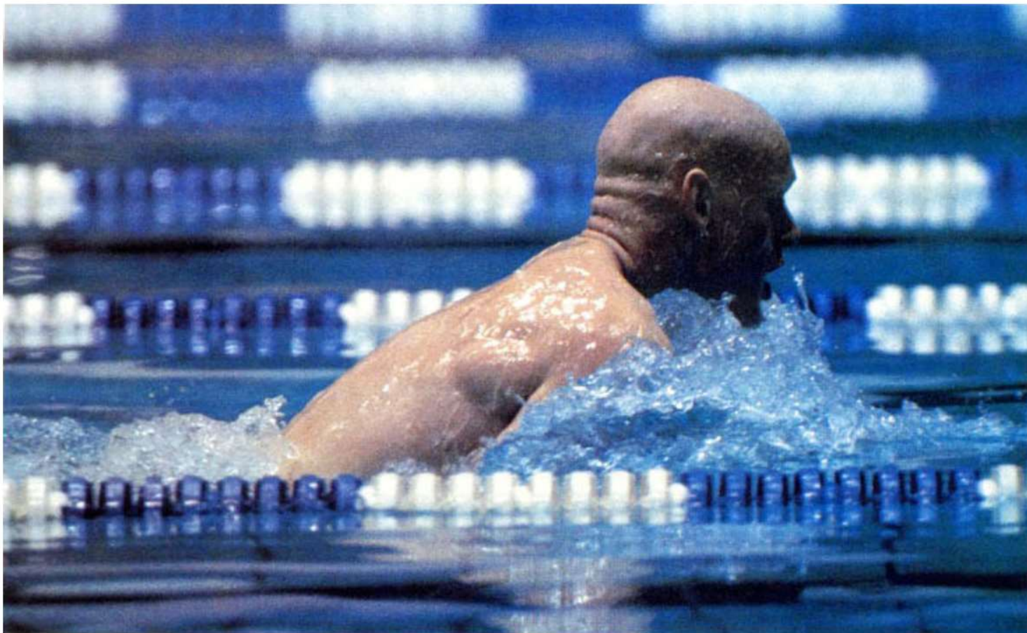
Duncan Goodhew (GBR), le vainqueur du 100 m brasse

The 100 m breaststroke champion Duncan Goodhew, GBR