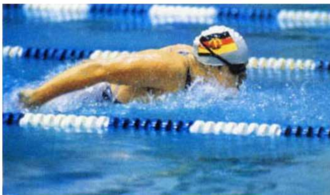
Les nageuses de la GDR, les championnes du 4X100 m libre The GDR swimmers, winners in women's 4X100 m freestyle